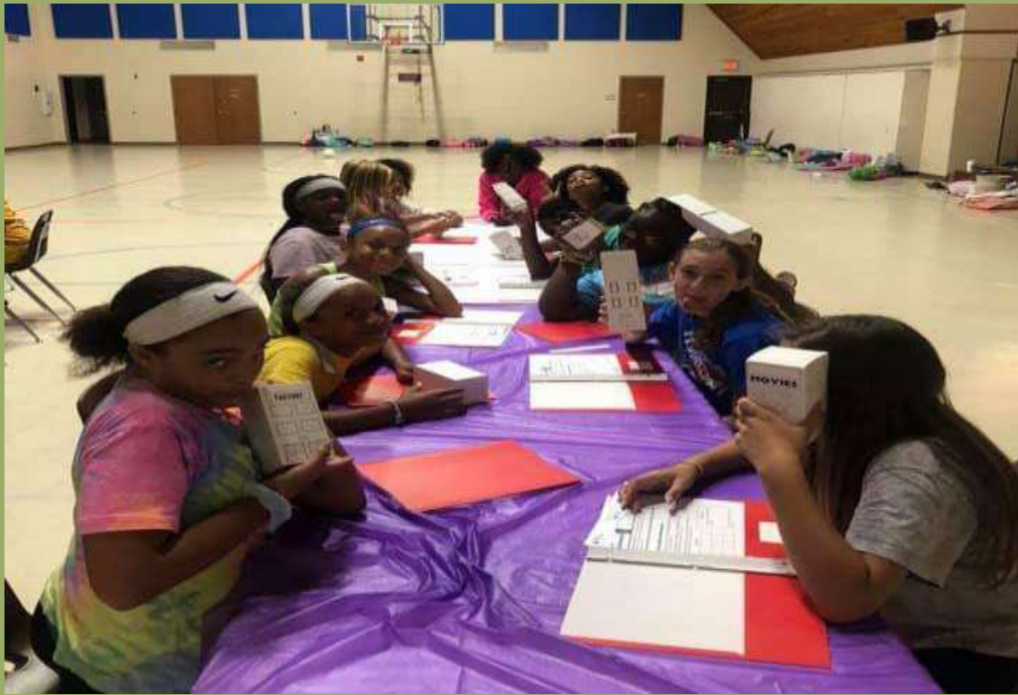
The leadership class that was held at Bethel United Methodist Church.